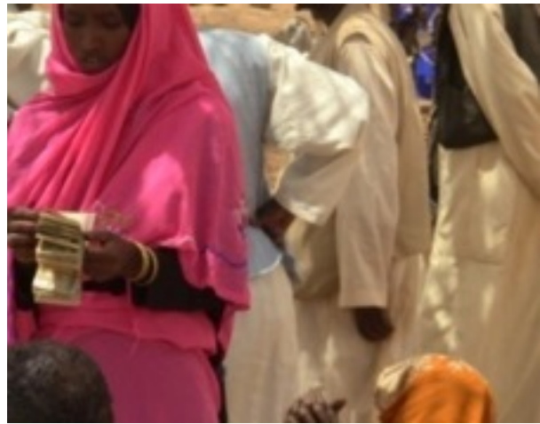
CESK staffs distributing the loans to the rural women