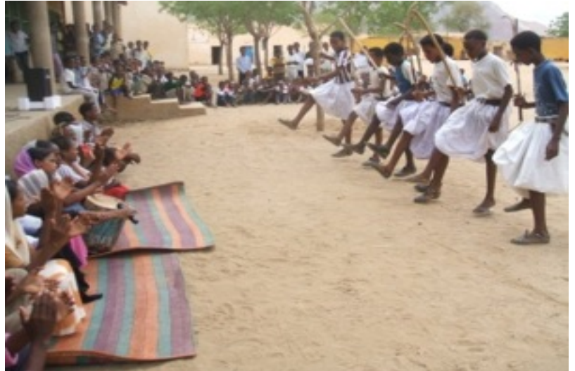
Cultural show during the opening of the school