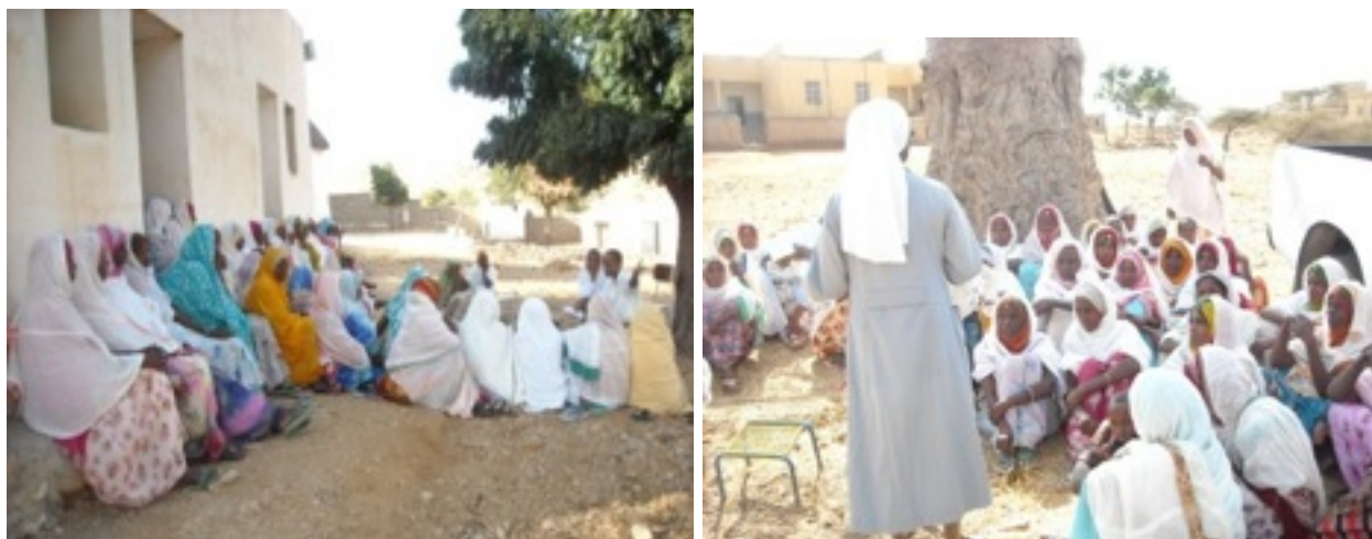
Women and junior school girls during Health campaigns

Result 2: 70% of the targeted women and girls are aware of their national and international women's rights.