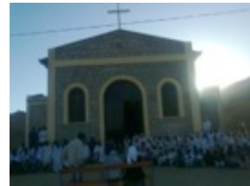
Testimonial campaigns in the Parishes of Dighi, Gilas and Azefa respectively

To training for the youth leaders coming the targeted parishes