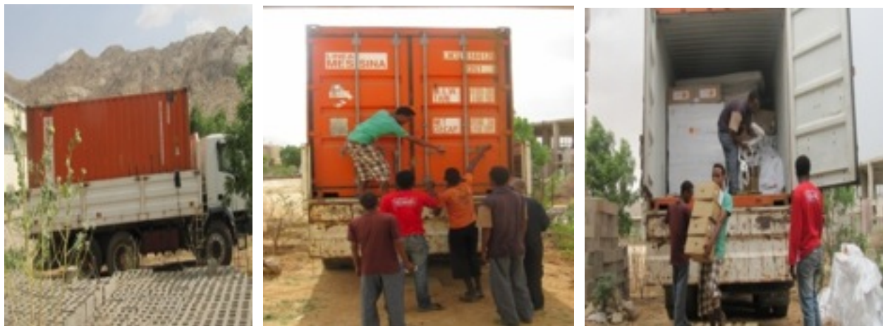
Medicine received from Progetto Agata Smeralda Onlus

The container full of medicine arrived on the 13 th of June 2013 and were immediately distributed the health facilities according to their needs and the request made.